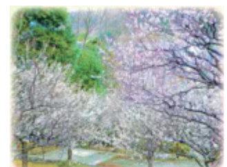
Tama Chuo Park (Ume-no-tani)

Please check the latest updates on plum blossoms