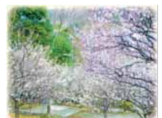
Tama Chuo Park (Ume-no-tani)

Please check the latest updates on plum blossoms